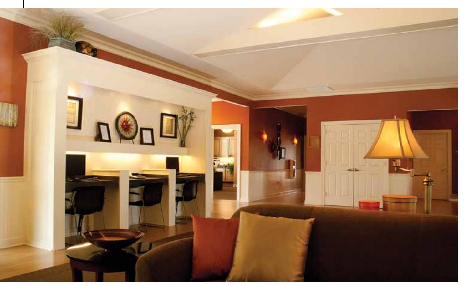
At North Central Village Senior Apartment Homes in Columbus, Ohio, interior public spaces were designed by RDL Architects to provide opportunities for engagement. Purposefully designed spaces, such as computer stations within the Great Room, provide opportunity for social interaction through incidental use.

views and access to the outdoors," she says. "Windows that look out on the courtyard encourage residents to connect with nature. Plantings and outdoor structures can also make outdoor seating/gathering areas feel more intimate." Transitional elements, such as porches or other covered outdoor structures, allow for ease of movement even during inclement weather, Meltzer adds.