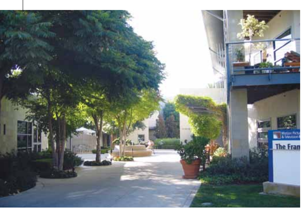
As designed by SmithGroupJJR, each of nine distinct garden spaces support resident wellness at the Fran and Ray Stark Assisted Living Villa in Woodland Hills, California (Motion Picture & Television Fund). Image courtesy of SmithGroupJJR

their homes, such as wider doorways, curbless showers, grab bars in the bathroom, and a floor plan that can be easily navigated. RDL Architects typically designs their senior living communities to meet accessibility guidelines, whether they are required by code or not, says Meltzer.